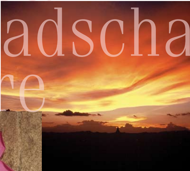
Figure 2. A marriage made in heaven. The color of a padparadscha has been described by some as the marriage between a lotus flower and a sunset, each shown above.