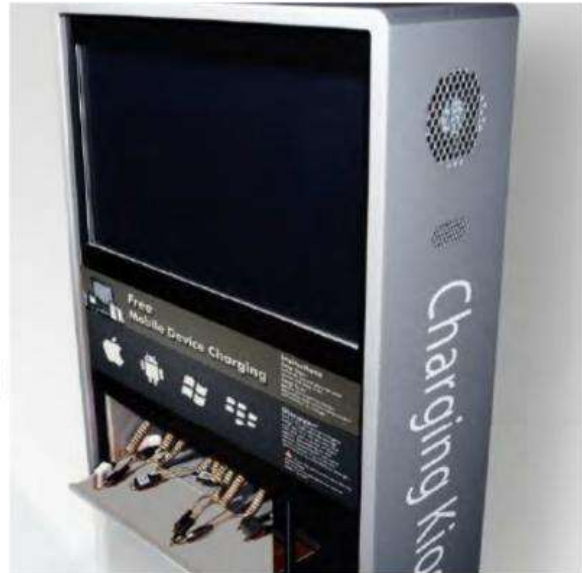
Charging Station Example