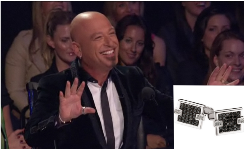
Howie Mandel wore black & white diamond cufflinks from AGTA Member Stuller.